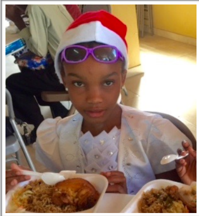
Students experienced immense joy at their Christmas party.

PO Box 8174 Grand Rapids, Michigan 49518 www.rescue-one.org