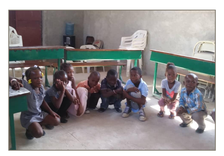
Some fun and some learning games

Pray, also, for a teen with an undiagnosed stomach issue. Pray that a diagnosis and cure will be found.