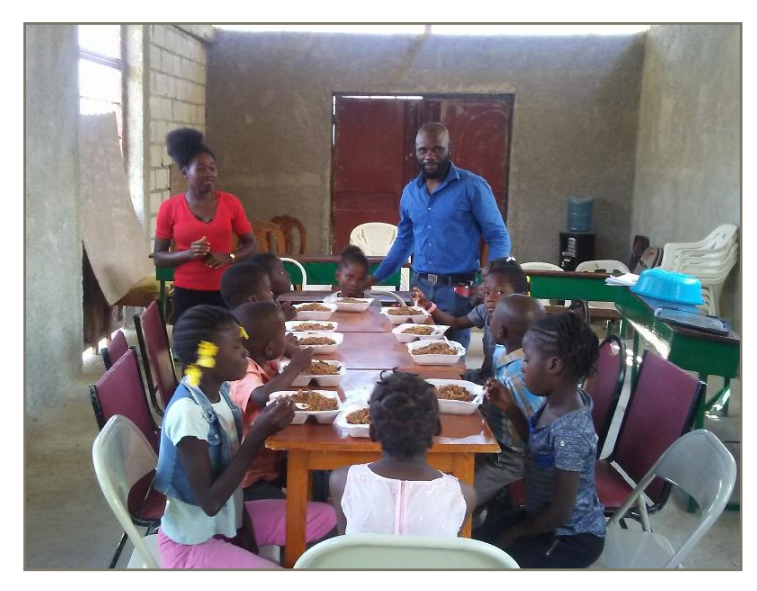
The children savor their daily dinner. In red shirt, the cook; in blue, the coordinator.