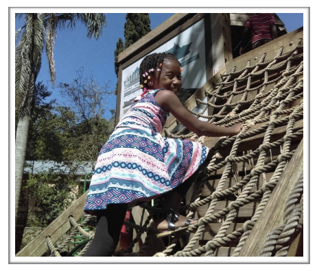
Fresh air, healthy exercise and games are an important part of summer camp.