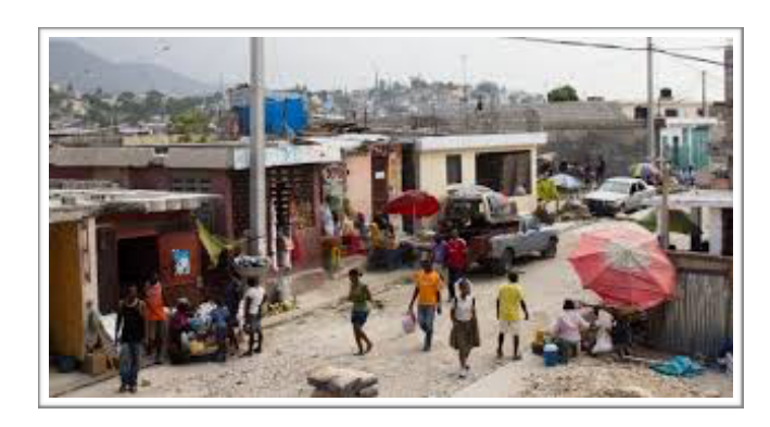
Crowded, smoggy streets of Port-au-Prince

The newest component of the Rescue One Program is the YEP. This fledging program was established to support the older students as they graduate from high school and enter university or trade school. At present, we are seeking additional funds to support these young people. You may make a gift designated specifically for this purpose. Thank you.