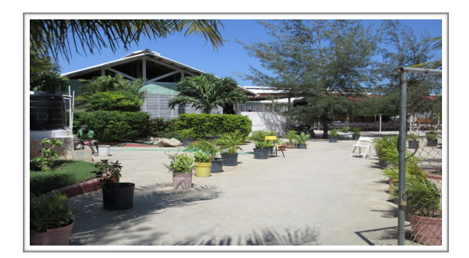
A wholesome Summer Camp venue

The Rescue One Board thanks you for your compassionate and generous support. Rescue One is a small light bringing God's grace into the lives of 80 Haitian children. Your check can be made out to the Rescue One Foundation, a 501(c)(3) corporation. Donations can be sent to PO Box 8174, Grand Rapids, Michigan, 49518, or you can donate by PayPal on our website. All contributions except for printing and mailing costs go directly to Haiti.