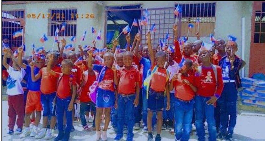
Students in the Beree program celebrate Flag Day in Haiti

PO Box 8174 Grand Rapids, Michigan 49518 www.rescue-one.org